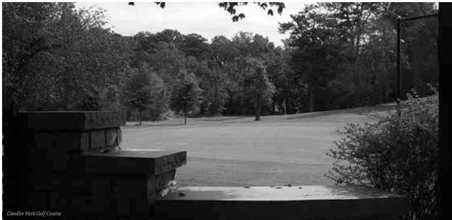
Candler Park Golf Course

The “absolutely fireproof” Iroquois Theatre in Chicago opened its doors for the first time on November 27, 1903. Seven days later, on December 3, 1903, it burned to the ground, costing 602 humans their lives and injuring 250 others who’d gathered to see a live stage show.