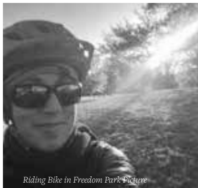
Riding Bike in Freedom Park Picture

In 2019 Freedom Park Conservancy will be the City Organizer for Jane's Walk. Jane's Walk is a movement of free, citizen-led walking tours inspired by Jane Jacobs. The walks encourage people to tell stories about their communities, explore their cities, and connect with neighbors. Anyone can lead a walk