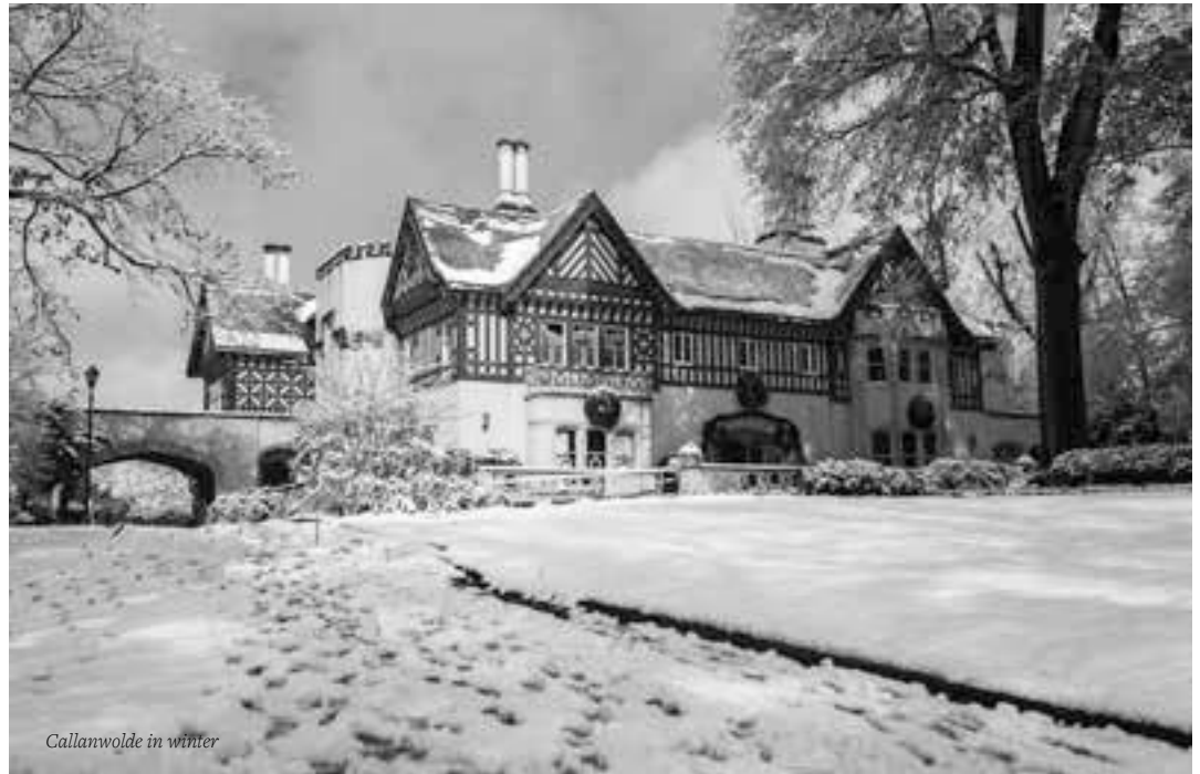
Callanwolde in winter