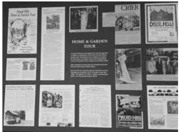
From Emory University's 'Druid Hills News' Exhibition

During the late 1940s, after the conclusion of World War II, a need for additional housing was identified, not just for Druid Hills, but for soldiers returning