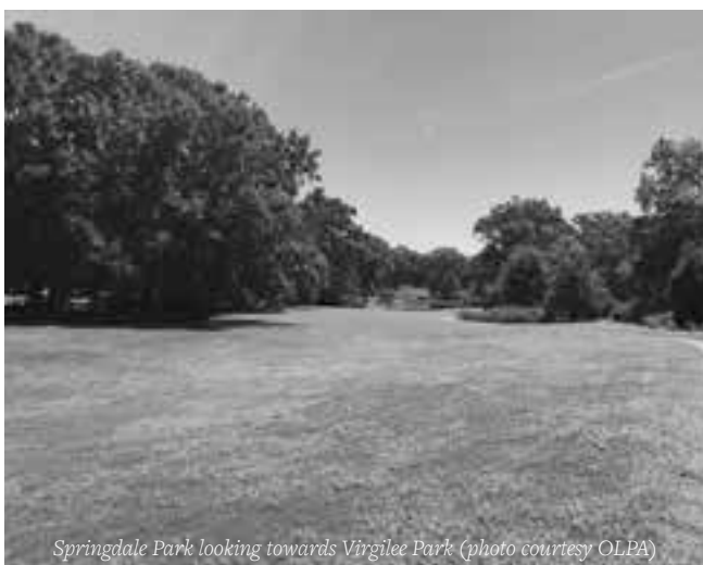
Springdale Park looking towards Virgilee Park

A group of far-sighted and tireless DHCA members and neighbors finally got the neighborhood listed as an historic district, and in 1979, the listing on the National Register of Historic Places. These designations were in the nick of time, because prior to 1979, Ponce de Leon in Druid Hills was zoned for high rise and multi-family. A high rise home for the elderly was planned for the corner of Springdale and Ponce; the golf club wanted a high rise apart-