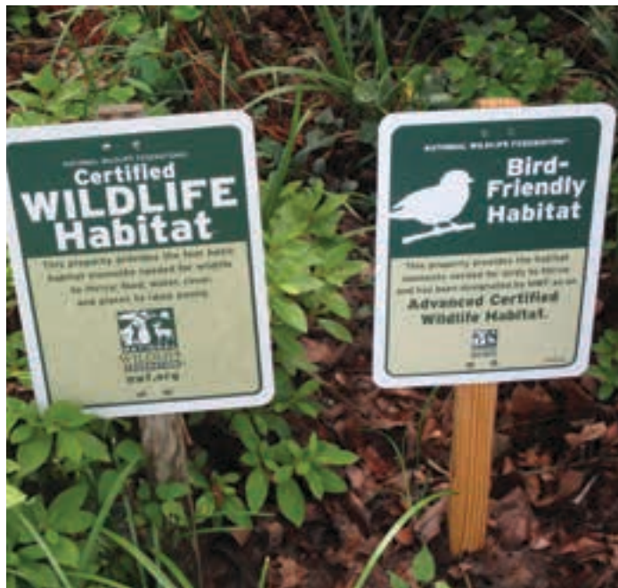
National wildlife signs in the author's yard.