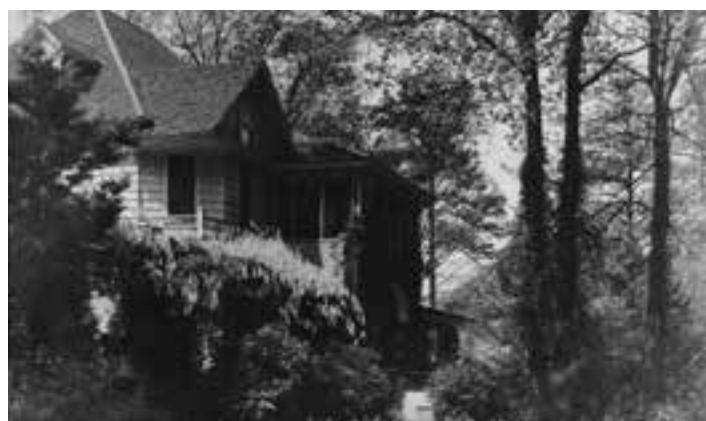
The Harrison home, Fernbank, during the late 1930s