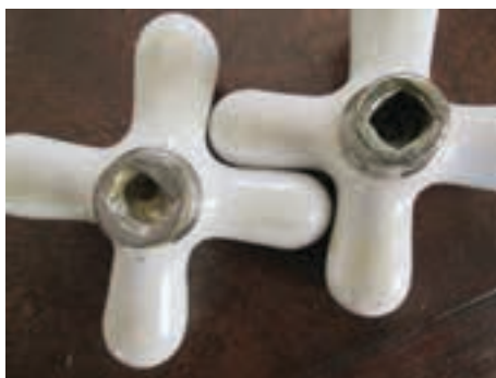
Worn-out 1917 porcelain handles

I needed something to close the tub valves so the water to the rest of the house could remain on. It was determined I needed either a sweat