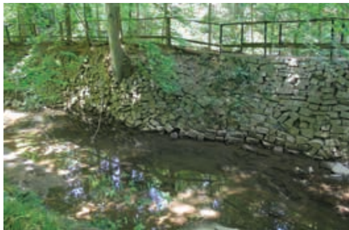
Man-made rock dam at The Falls.

The land is pristine and unspoiled. It has the feeling of deep woods far from any city or thoroughfare, a shady oasis of natural beauty in the midst of Druid Hills and seemingly miles away from the bustle of traffic and commerce on North Decatur and Clairmont. This spot of beauty — a place where history and botany hold hands — is an unselfish gift to all of us and to future generations of Druid Hills residents. The motto of The Falls property is: Where nature comes first.