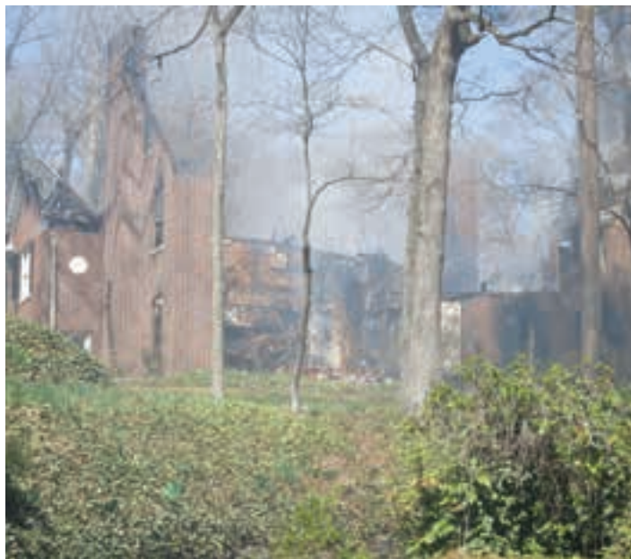
The Handleys' home on Lullwater Road continued to smoke the morning after the fire.

Although the cause of the fire was never determined, the Handleys