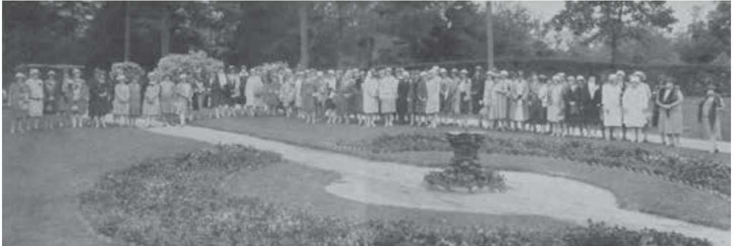
A 1929 gathering of the founders of the Garden Club of Georgia, including delegates from the Lullwater Garden Club.