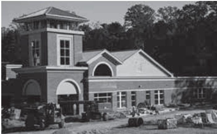
The new Fernbank Elementary School.

There are lots of things happening in the Atlanta Public Schools (APS) system, including the move to a Charter System next school year. Check out this information, along with the $90 million plan to expand Grady High School, reopen and transition Howard High School into a new middle school, renovate Morningside Elementary, and more. The funding of these plans depends on the outcome of the next SPLOST referendum. Check out APS' website: http://www.atlanta.k12.ga.us/Page/1