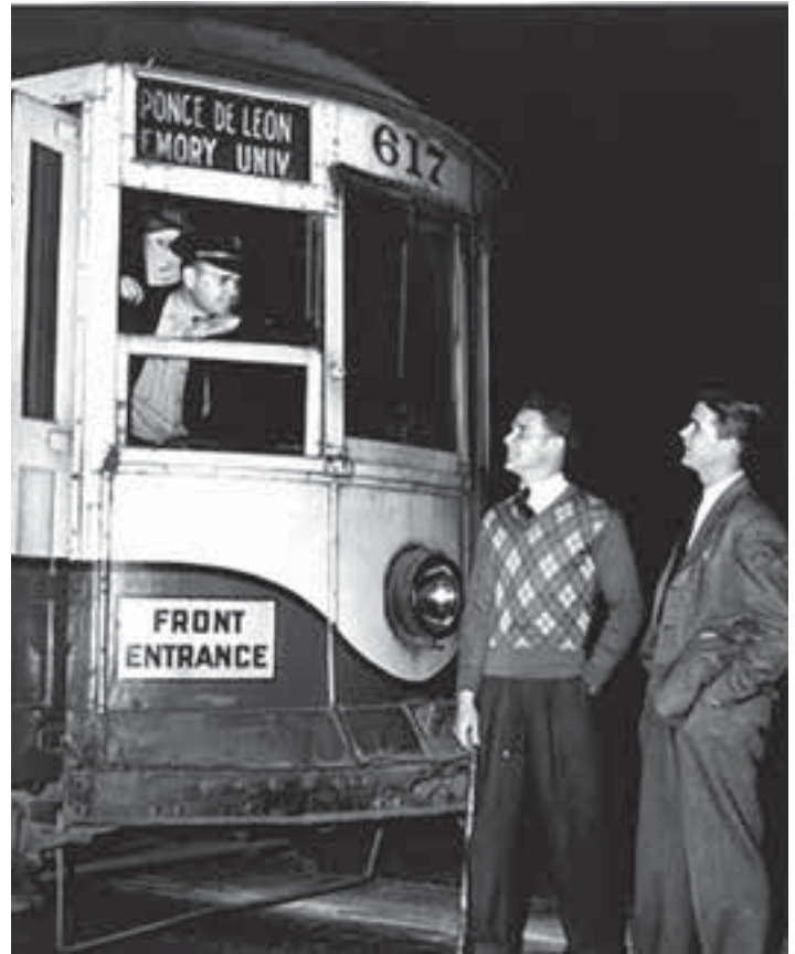
Two Emory students inspect the trolley car

In the next edition of the Druid Hills News, other stores in Emory Village will be highlighted.