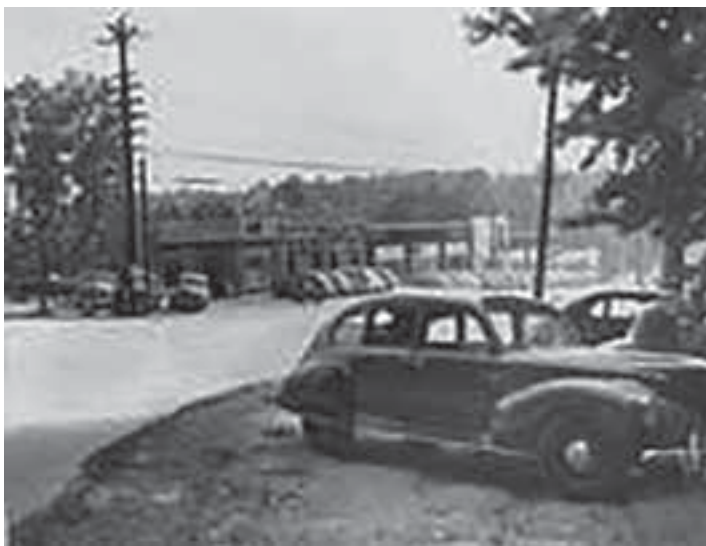
Emory Village, 1940s